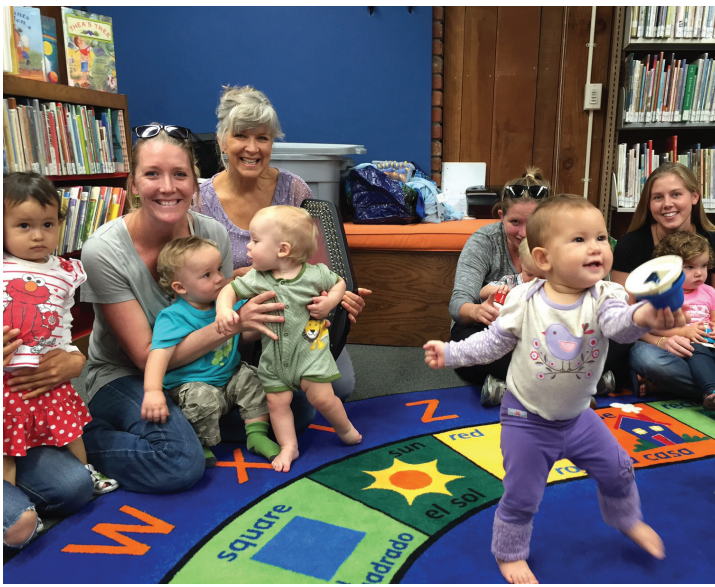
Enthusiastic participants in Music and Movement for Toddlers, a six session program sponsored by The Friends of Carmel Valley Library.

mailing label, you are already a voting member. If not, it is not too late to join.) The slate of candidates appears in this newsletter and there is a return envelope to mail in your ballot. You can also drop it off at the library desk prior to November 7th or bring it to the meeting.